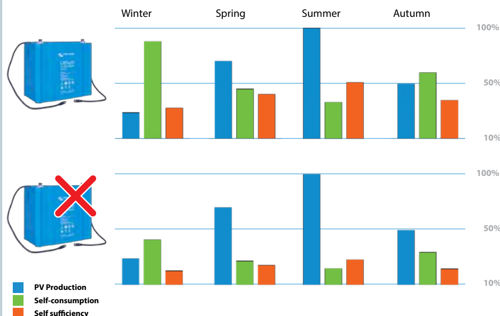
Typical seasonal variations at roughly 50 degrees latitude ~ Seattle, London, Amsterdam, Berlin, München ~ with battery and without battery.

The average household with two children would fully utilize a 4,6 kWh Li-ion battery; one additional battery module.